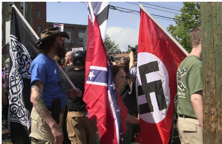
Charlottesville, Virginia, 2017