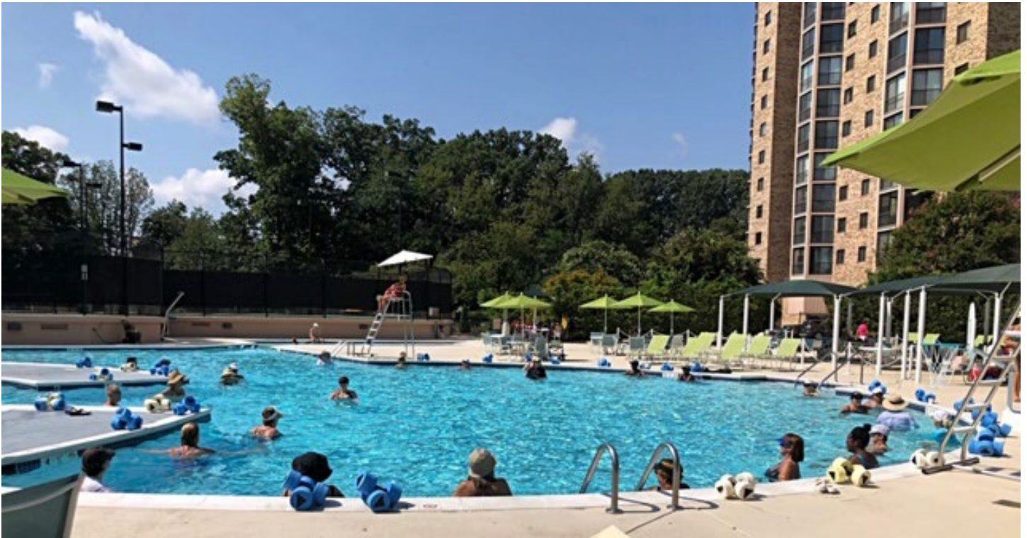
Water aerobics