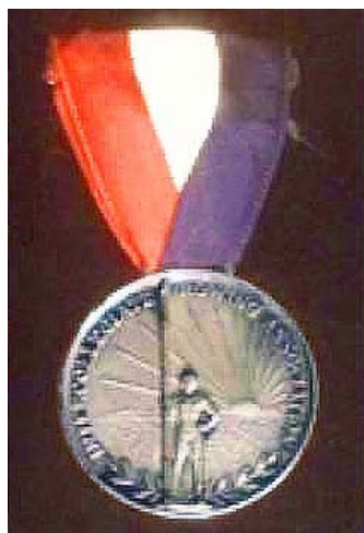
The Montebello Voice

USNA Navy Crew Honor: On 17 June 1967, in front of 15,000 crew fans, the 1967 USNA 2V8 dramatically & decisively won its IRA Regatta of 14 top rowing colleges— beating nearest competitor Penn by a full two lengths, and having even more open water on Wisconsin, Cornell, Washington, Syracuse, California, Rutgers, Dartmouth, Princeton, UCLA, Brown, Northeastern, and Stanford—bringing the Kennedy Challenge Trophy back to USNA for the fifth time in history. (Intercollegiate Rowing Association and Syracuse Herald-American)