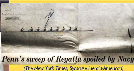
Penn's sweep of Regatta spoiled by Navy