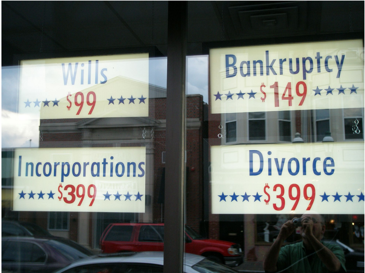
Signs of life (and death)