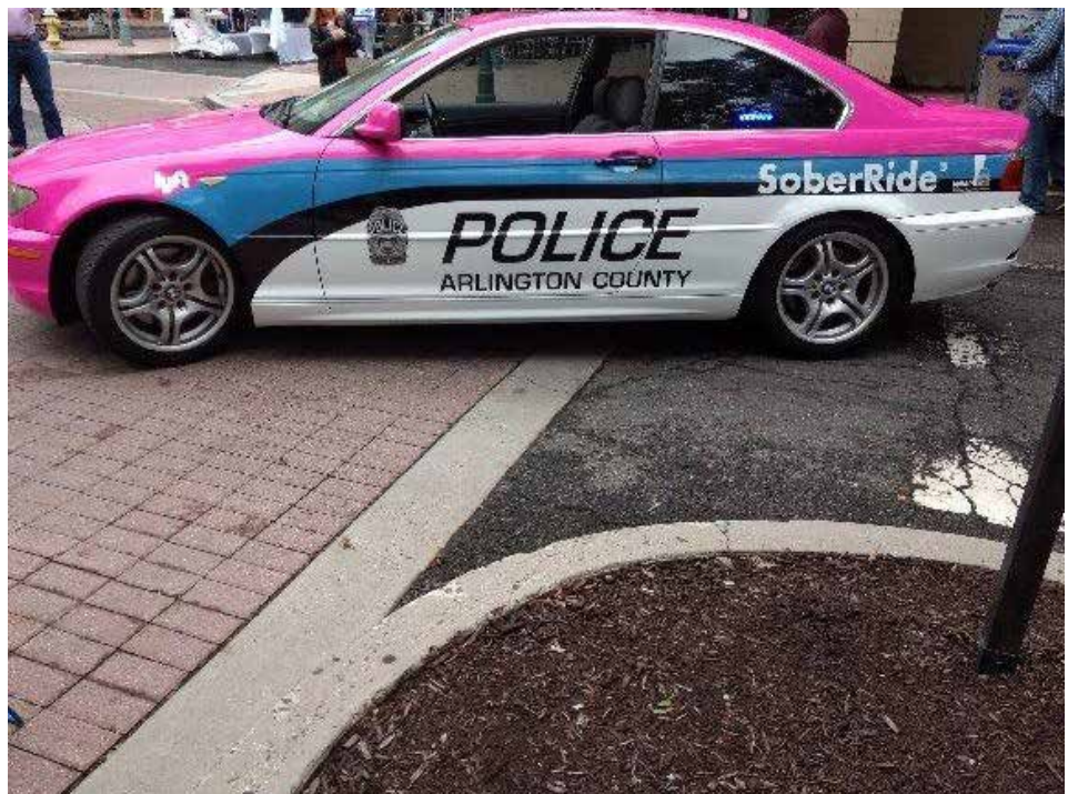
I was walking in Shirlington last Saturday and saw this police car. I was told it was pink for Breast Cancer Awareness Month (October) and also to hand out Sober Ride Cards for those who will be imbibing quite a bit.

The Montebello Voice wants to hear from you: musings, travels, announcements, photos, book reviews, commentary, memoirs, essays, analysis, poems, suggestions, club news, recipes, and free ads A twice-monthly publication for the residents, by the residents