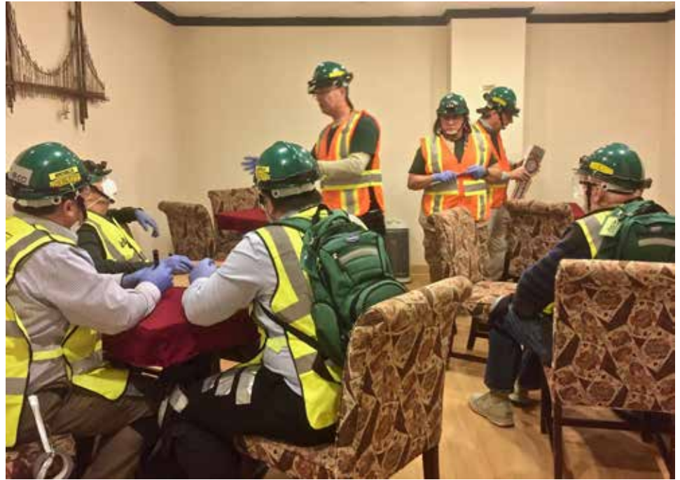
Residents and staff participate in the weekly Montebello Community Emergency Response Team (CERT) training, which simulates real world emergency scenarios.

In other news, in addition to the current elevator cameras in Building 2, all other buildings will have security cameras to catch brazen vandals, pooping pooches, and smooching couples. The cost for this upgrade will be $36,000 and the footage will be kept for 30 days. 📺