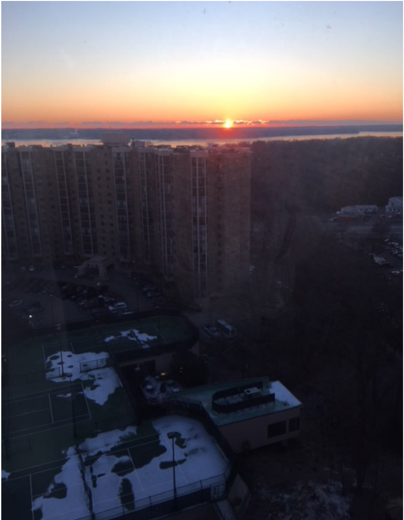
January 1 sunrise