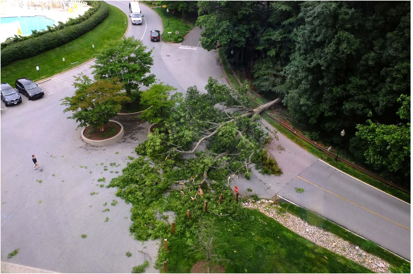
A tree fell in the forest.