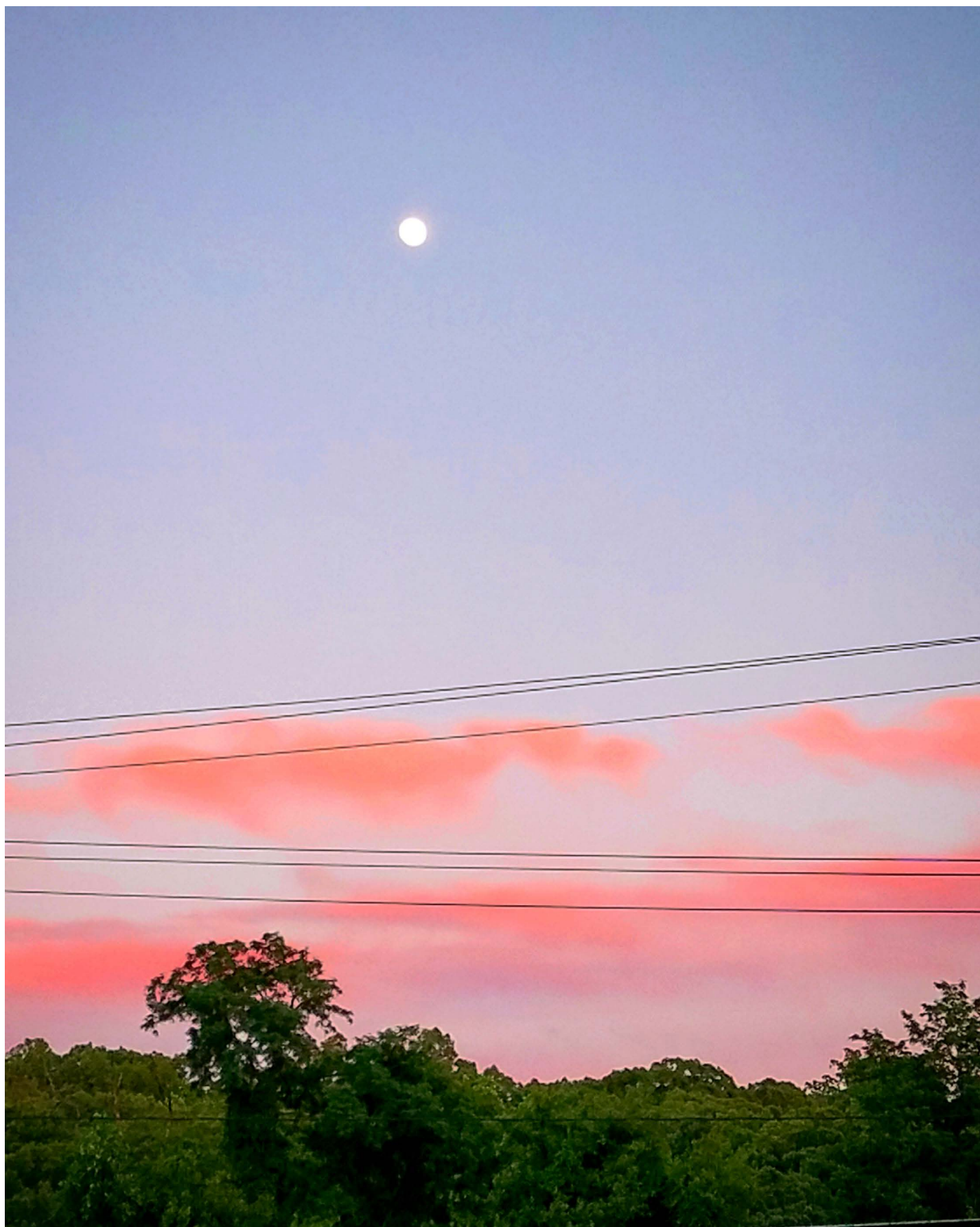
Moon over Montebello